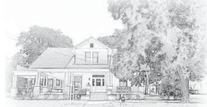
House of Hope & Restoration

The House of Hope and Restoration is proud to be Pike County's sole provider of crisis services for women. Their central goal revolves around assisting women affected by addiction, homelessness, abuse, and transition, offering vital support and resources.